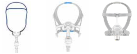
AirFit P10 for AirMini AirFit N20* AirFit N20 Classic