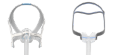
AirTouch N20* AirFit N30 for AirMini