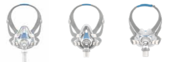
AirFit F20* AirTouch F20 AirFit F30